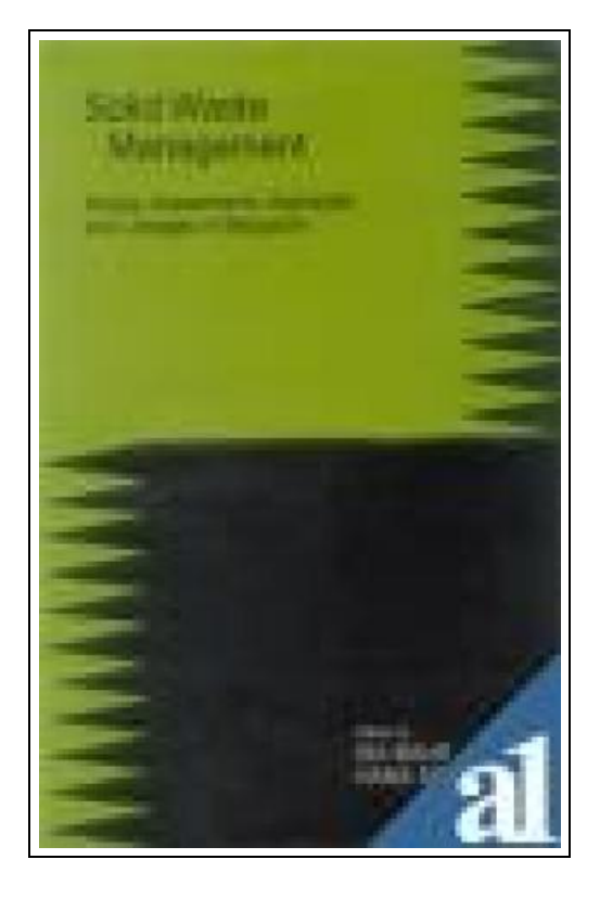
Filesize: 5.08 MB