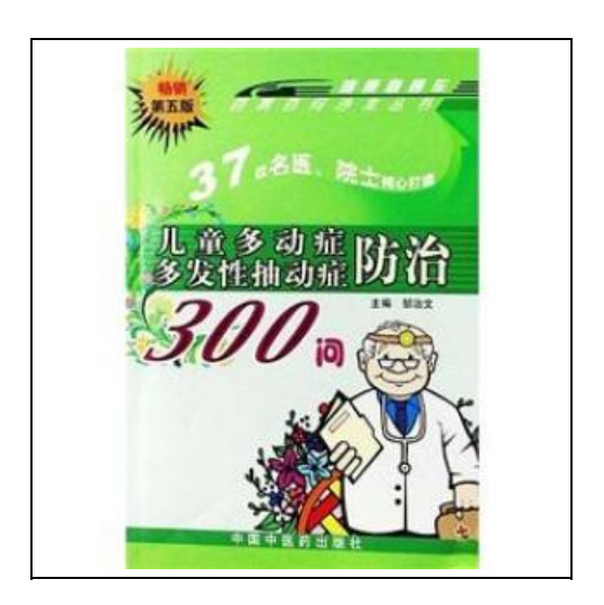
Filesize: 8.06 MB