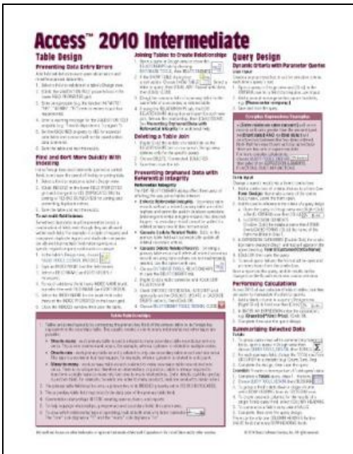
Filesize: 1.82 MB