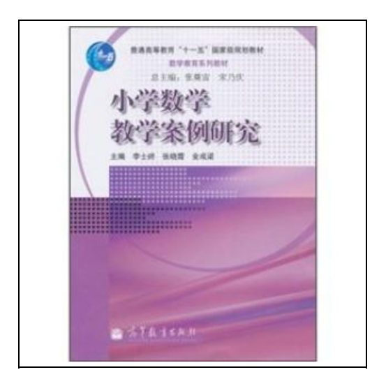
Filesize: 5.19 MB