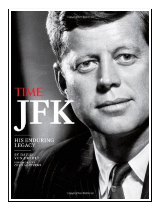
Filesize: 7.14 MB