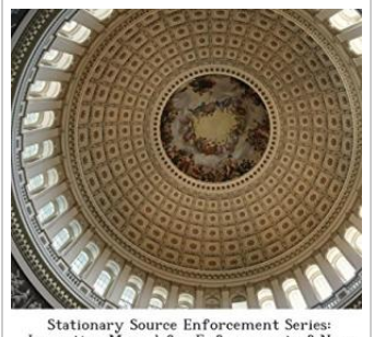
Stationary Source Enforcement Series: Inspection Manual for Enforcement of New Source Performance Standards, Secondary Brass and Bronze Ingot Production Plants