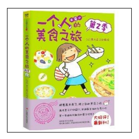
Filesize: 9.33 MB