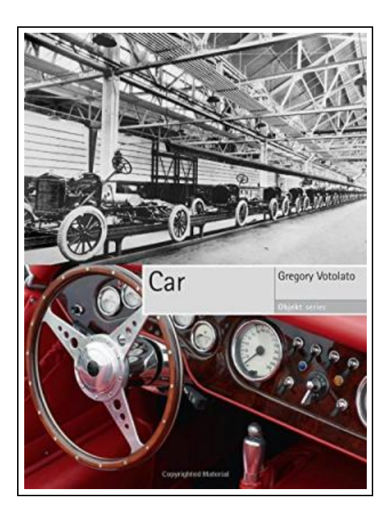
Filesize: 8.07 MB