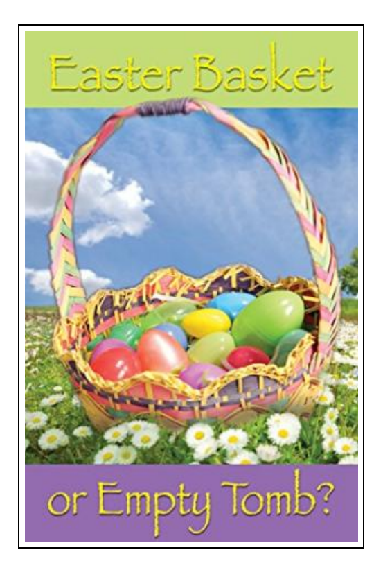
Filesize: 4.25 MB