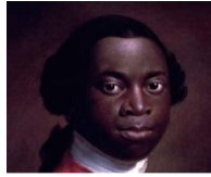
The Interesting Narrative of the Life of Olaudah Equiano Olaudah Equiano