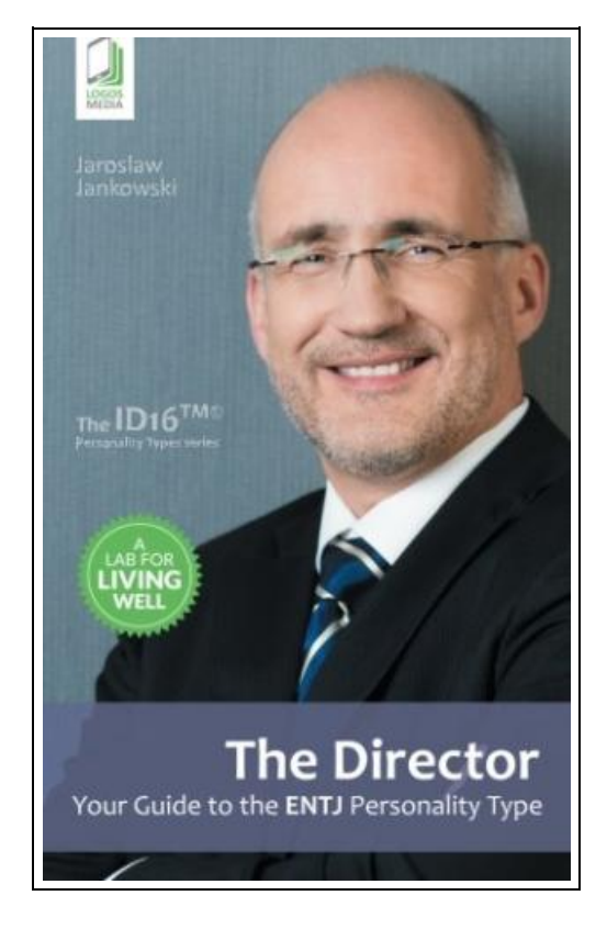
Filesize: 9.34 MB