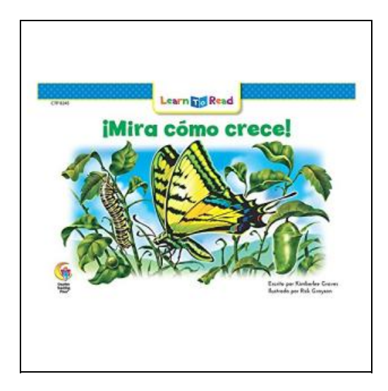
Filesize: 6.56 MB