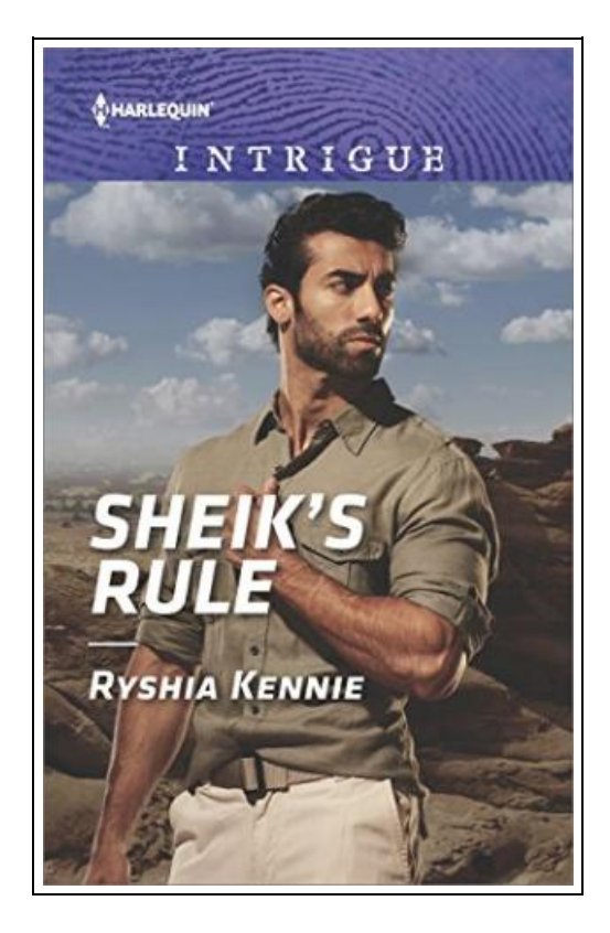
Filesize: 4.91 MB