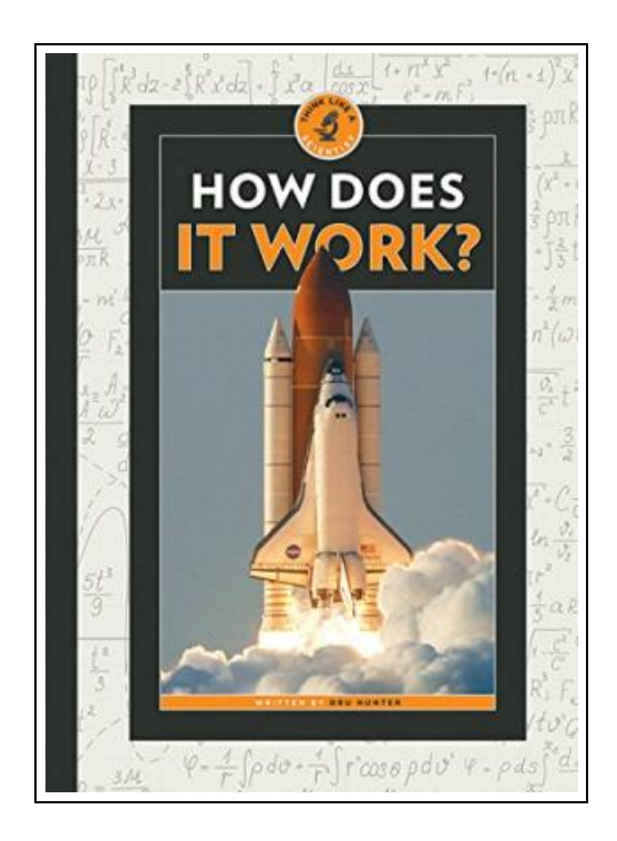
Filesize: 8.8 MB