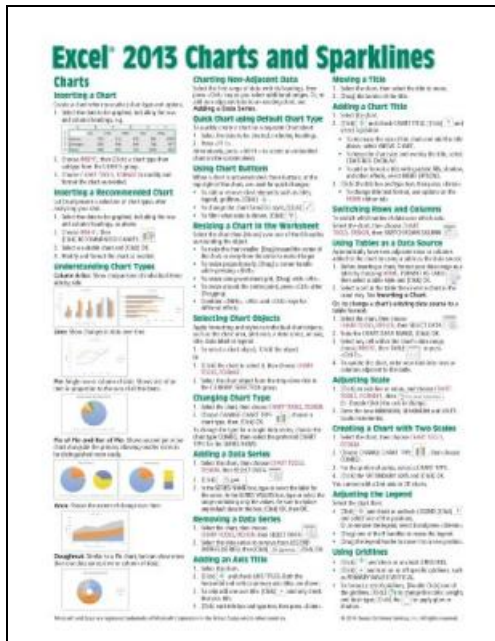
Filesize: 4.59 MB