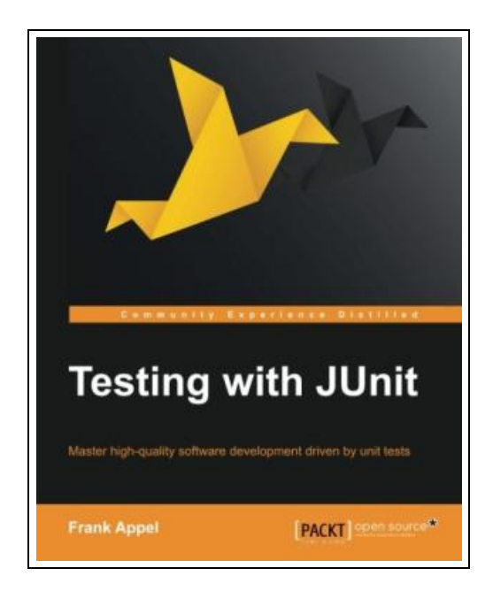
Filesize: 3.93 MB