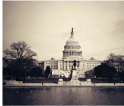
US Census Bureau: County Business Patterns 1995: Alaska