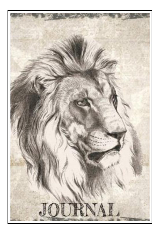
Filesize: 4.36 MB