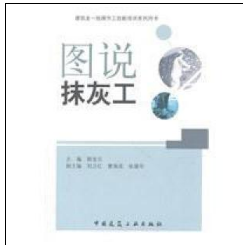
Figure that plastering work