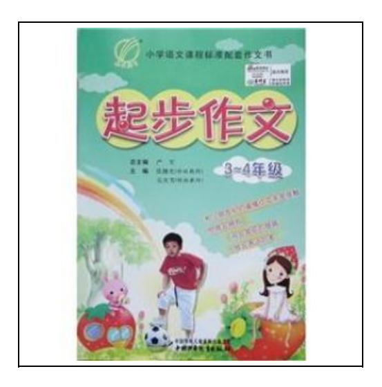
Filesize: 2.45 MB