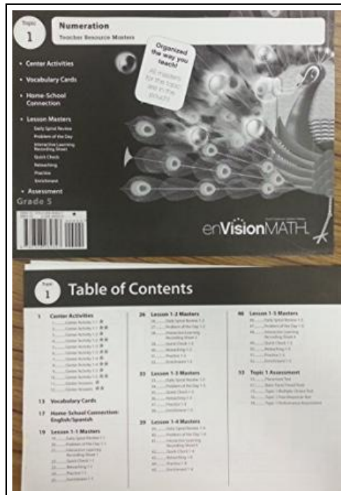
Filesize: 5.01 MB