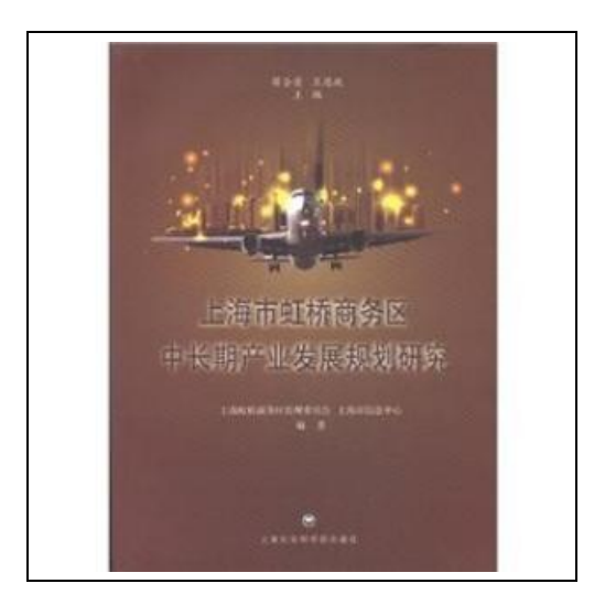
Filesize: 5.49 MB