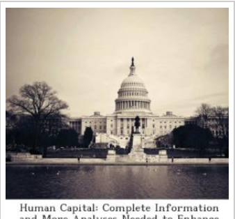
Human Capital: Complete Information and More Analyses Needed to Enhance DOD's Civilian Senior Leader Strategic Workforce Plan: GAO-12-990R

U.S. Government Accountability Office (GAO)