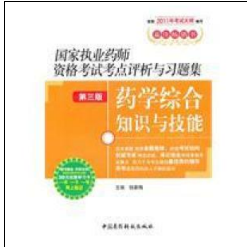
Filesize: 9.18 MB