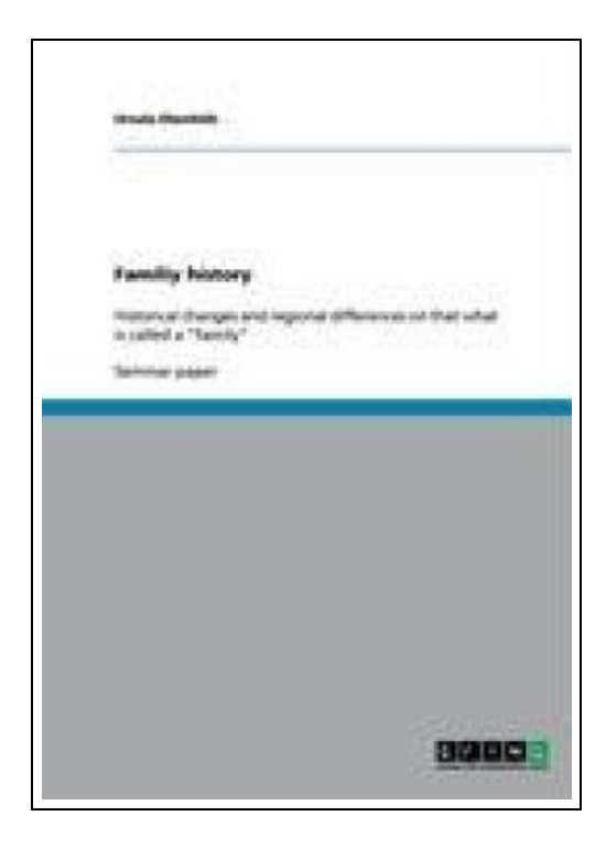
Filesize: 4.35 MB