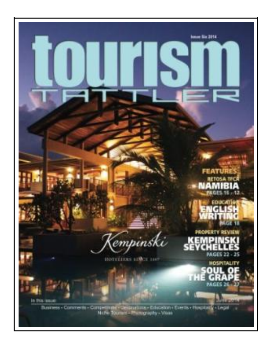
Filesize: 2.23 MB