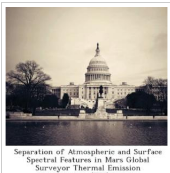
aration of Atmospheric and Surface Spectral Features in Mars Global Surveyor Thermal Emission Spectrometer (TES) Spectra